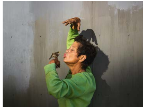
Untitled Los Angeles, 2015