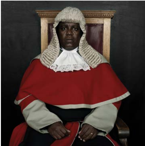
The Honourable Justice Moathodi Marumo 2005