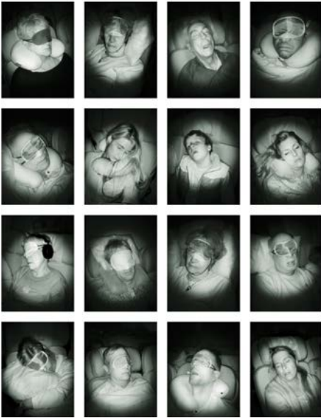
The Journey (panel 1) 2014