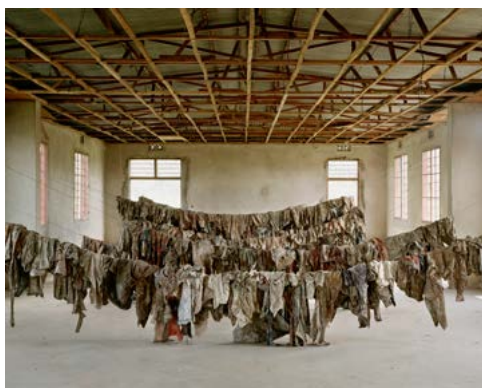
Clothing removed from genocide victims at Murambi Technical School where approximately 50,000 people were murdered by Hutu militias in the classrooms Murambi, Rwanda, 2004