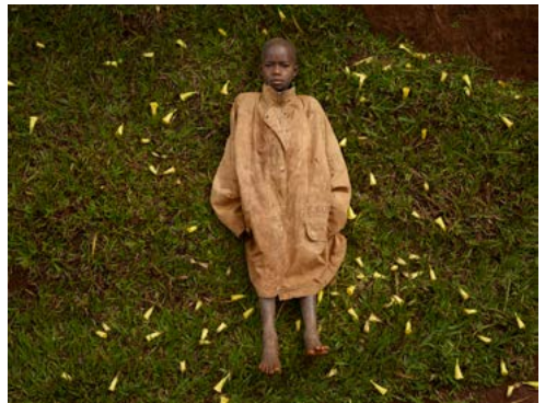
Portrait #1 Rwanda, 2014